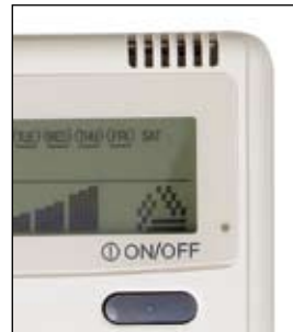
Integral Temperature Sensor

Energy Saving up to 38% with INVERTER Technology