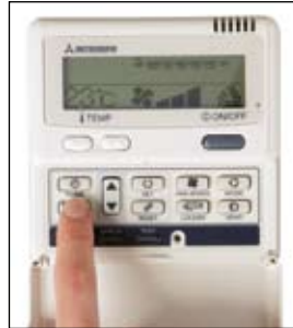
RCE1 Wired Controller