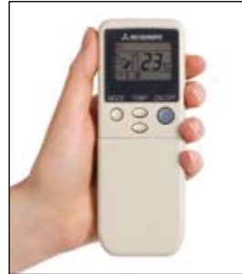
Optional 'Wireless' Controller

Energy Saving up to 38% with INVERTER Technology